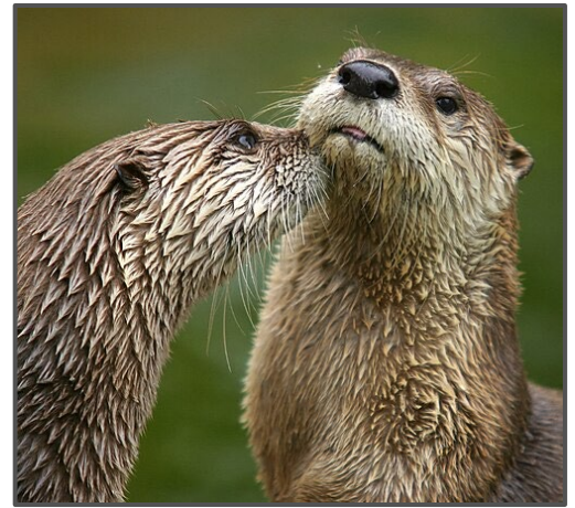
North American River Otter ( Lontra canadensis )