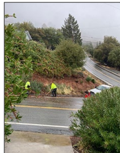
County crew clearing roadside debris in November 2024

The County clears debris when possible, but they can't reach every property throughout the rainy season. Thanks to everyone for helping keep our rainwater flow under control.