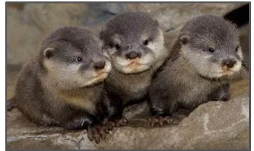
Young river otters